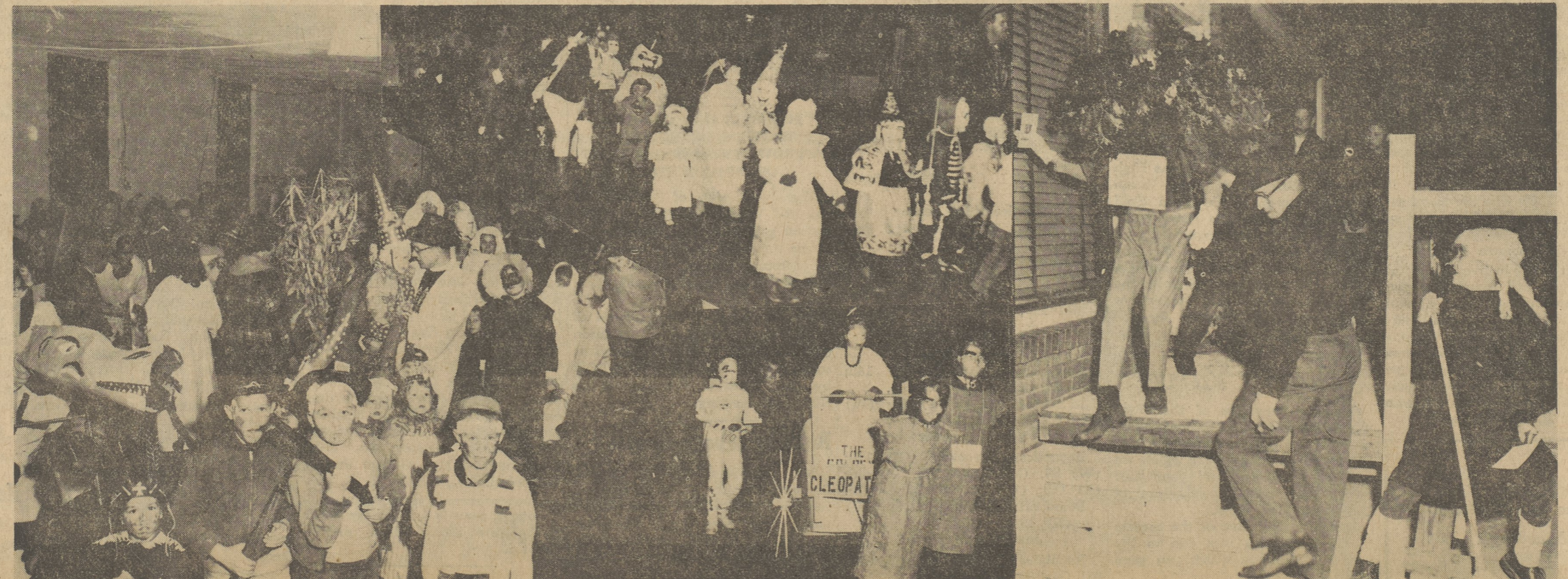
What strange manner of people have we here? Winners line up for presentation of awards, left, inside Dr. Henry M. Laing fire hall. Looks like a collection of cowboys and Indians in the front, and then a lot of clowns, and a dragon, and