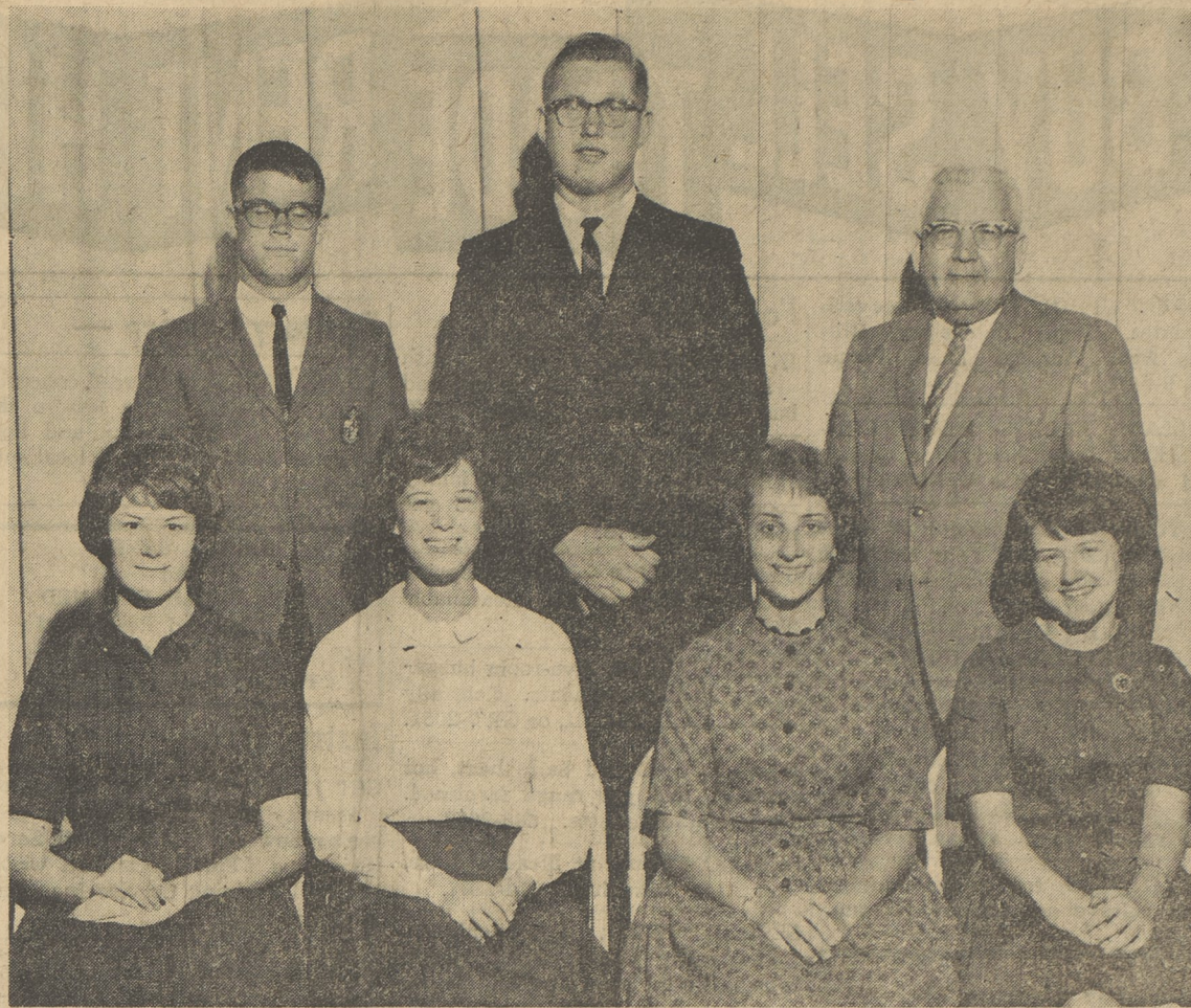
Six Dallas Senior High students, all seniors, were honored recently for high performance on the National Merit Scholarship Qualifying Test. Each student was given a

formal Letter of Commendation signed by his principal and the president of the National Merit Scholarship Corporation.