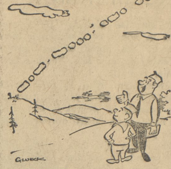
"Little Bear wants to pass his code requirement."