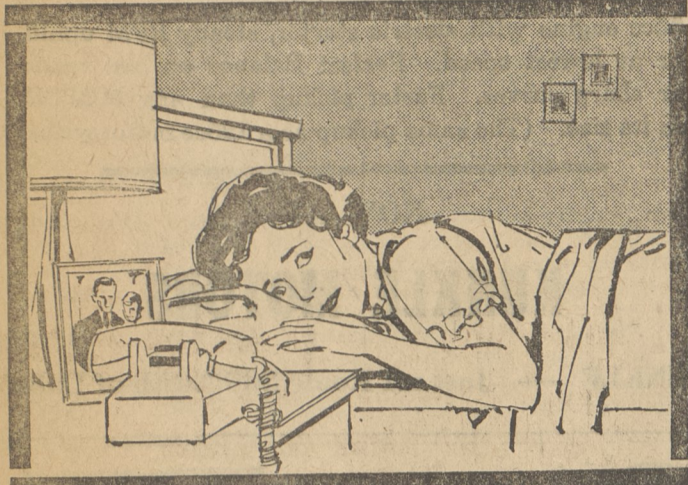
WHEN YOU'RE FEELING DOWN...

GREENWALD'S IN LUZERNE ONE STOP SHOPPING CENTER FURNITURE • GIFTS • HOUSEWARE