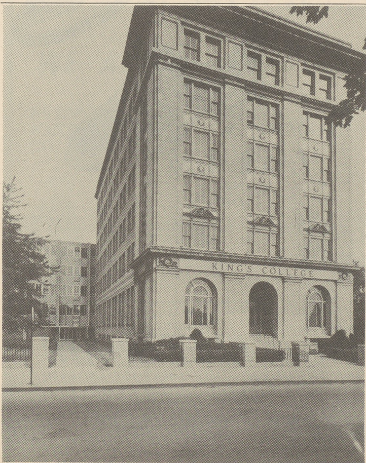
Pictured above is the Main Building of King's College, on North River Street, Wilkes-Barre.

Second was given in Scranton as part of the University's Diamond Jubilee celebration.