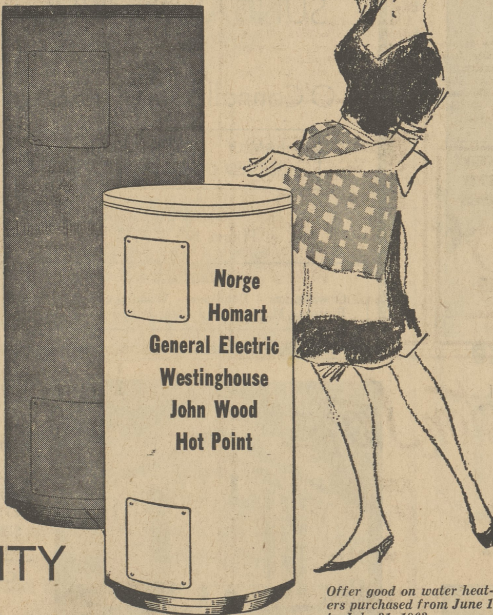
Offer good on water heaters purchased from June 1 to July 31, 1963.

Economical Low initial cost... easier than ever to install... low operating cost... can be installed anywhere.