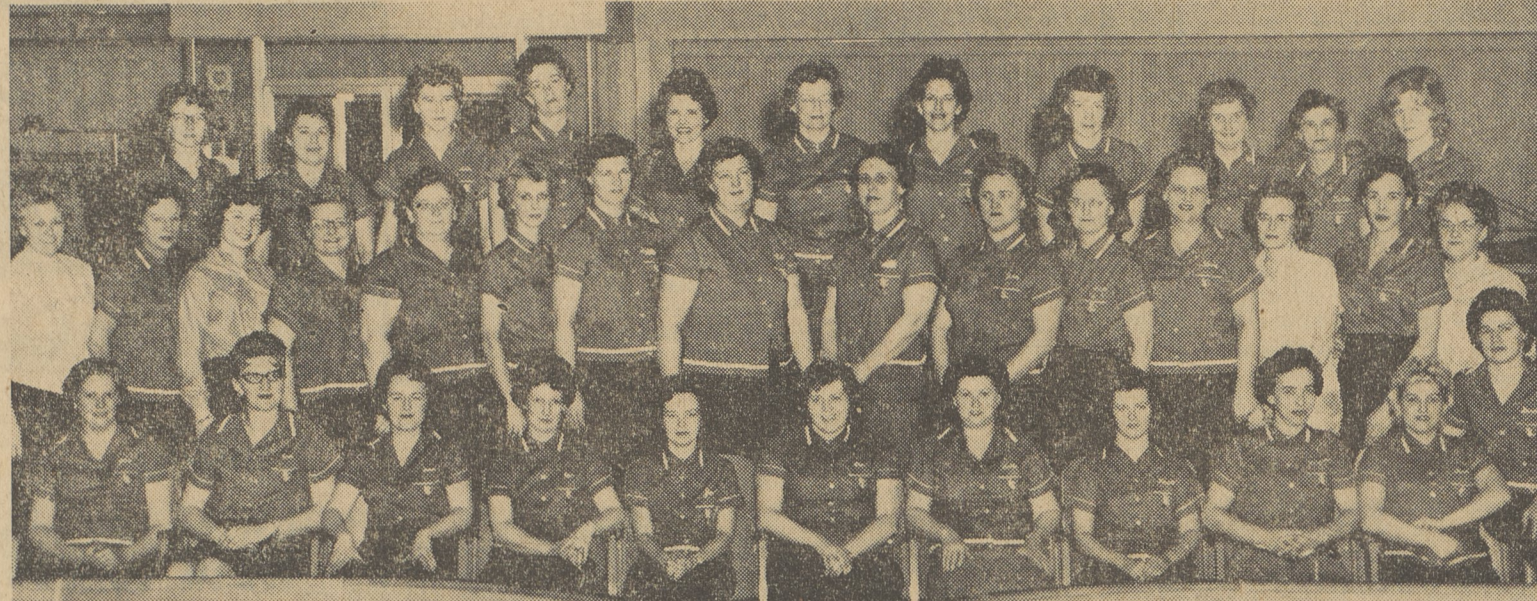
The Imperialettes is the largest group of girls bowling out of Crown Imperial Lanes. The league, made up of ten teams, participated in the second annual March of Dimes Tournament which took place in this area the past two weeks.