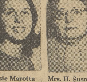
1316 Main St. 742 Wheeler Ave. 415 N. Webster