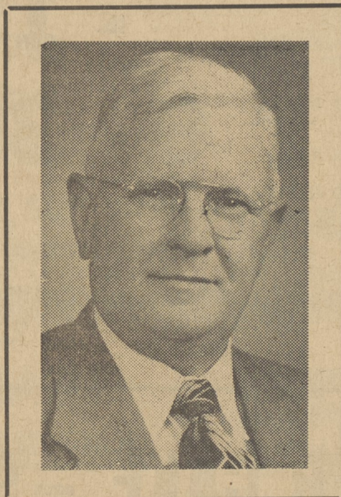
Senator HAROLD E. FLACK