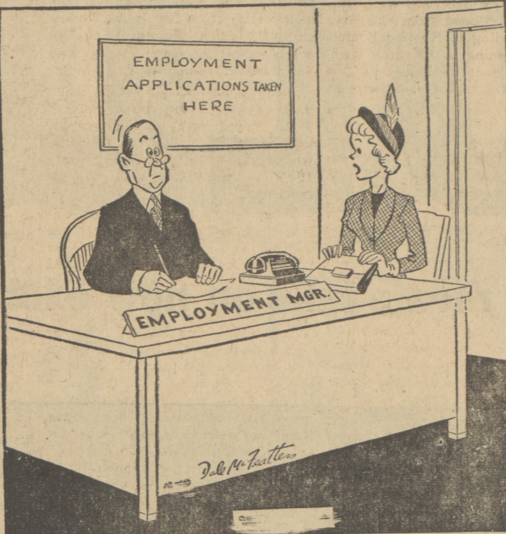
"Why should I remember my phone number? I never call myself!"

after spending several weeks with relatives and friends here.