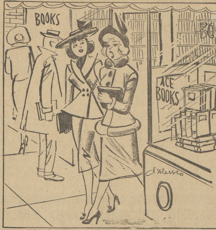
"Goodness, they sell nothing but books in there. How DO they make a living?"