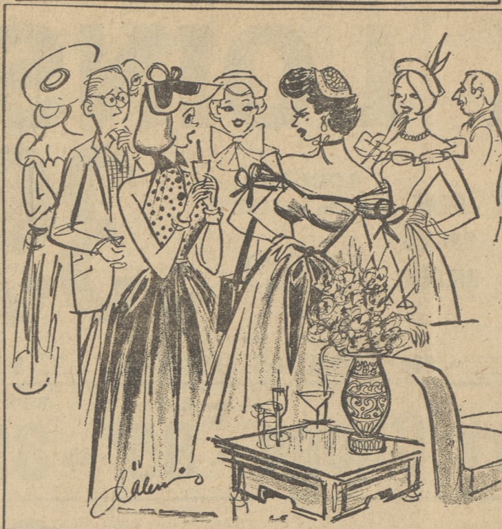
"I've seen all your television performances, Miss Savor. Wonderful! How long ago were they filmed?"