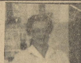
V. CRUGER BOX 212 ELMHURST, PA.