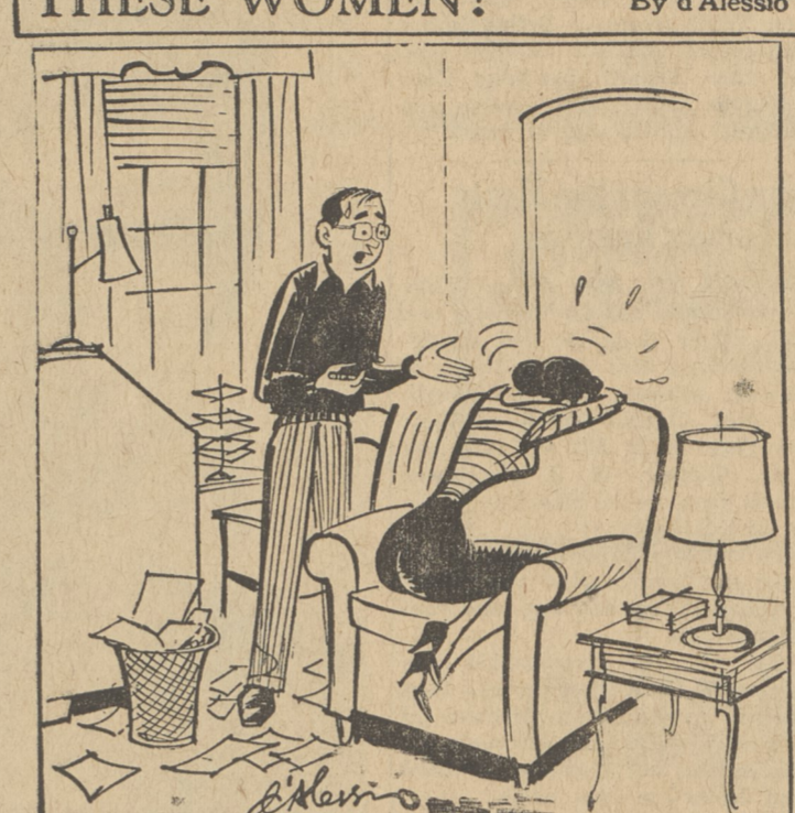
"But it was a slip of the tongue, darling! I meant to say you were deductible—not expendable!"