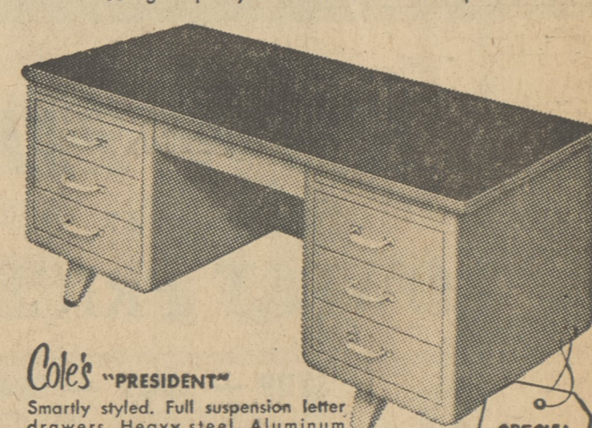
Cole's "PRESIDENT" Smarly styled. Full suspension letter drawers. Heavy steel. Aluminum trimmed linoleum top. Lock on center drawer locks all drawers. 60" wide x 30" deep. No. 1562 1 letter, 4 box drawers... $159.50 No. 1563 2 letter, 2 box drawers... 159.50 SPECIAL PRICE $159.50

These are genuine Cole Steel desks in their original packing. We had to forego our regular markup in order to bring prices down to this level. Never before have desks of so high a quality been offered at so low a price.