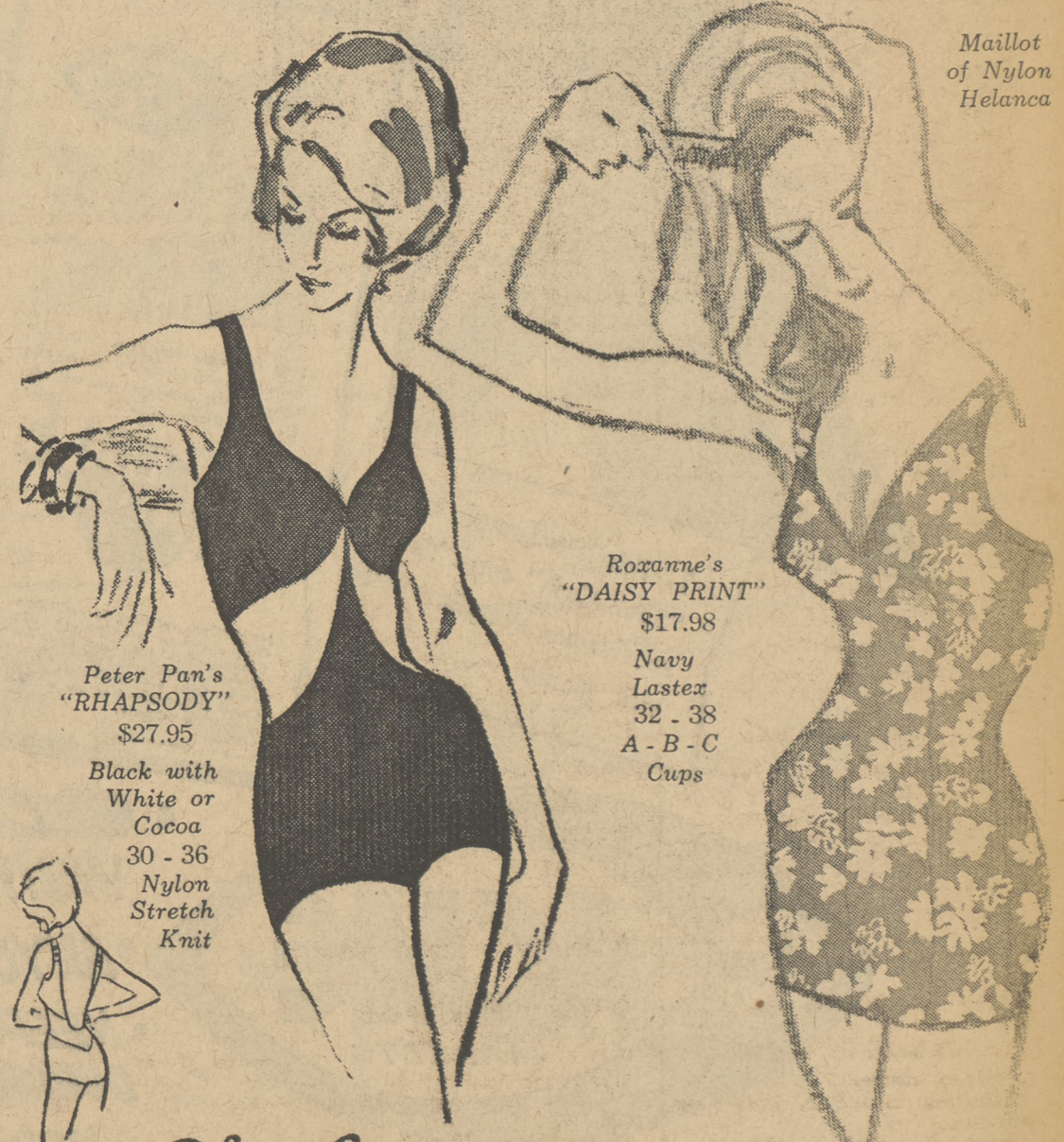
Maillot of Nylon Helanca