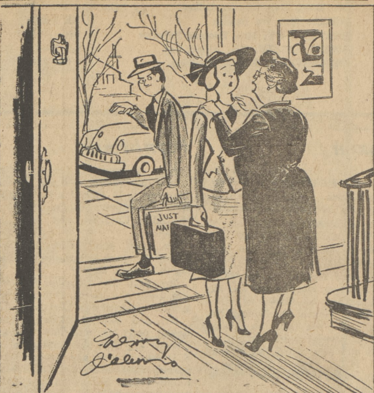
"Now, promise me you'll be a good wife — industrious, thrifty, domineering . . ."