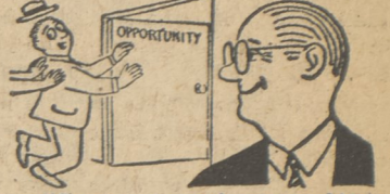
"Some people are like wheelbarrows—they stand still unless they are pushed."