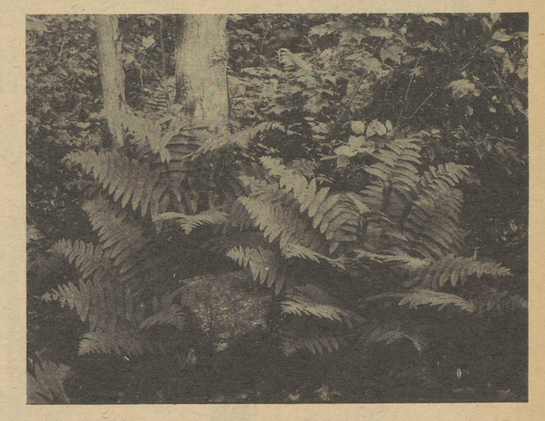
Osmunda fern huddles close to the grateful coolness of a damp rock, dripping with moisture. In a much enlarged version, featuring the cool rock centrally placed, the composition suggests a mural developed in silver grey, black and white.

Soon the hillsides will be rosy with pink azalea, Mountain Honeysuckle.