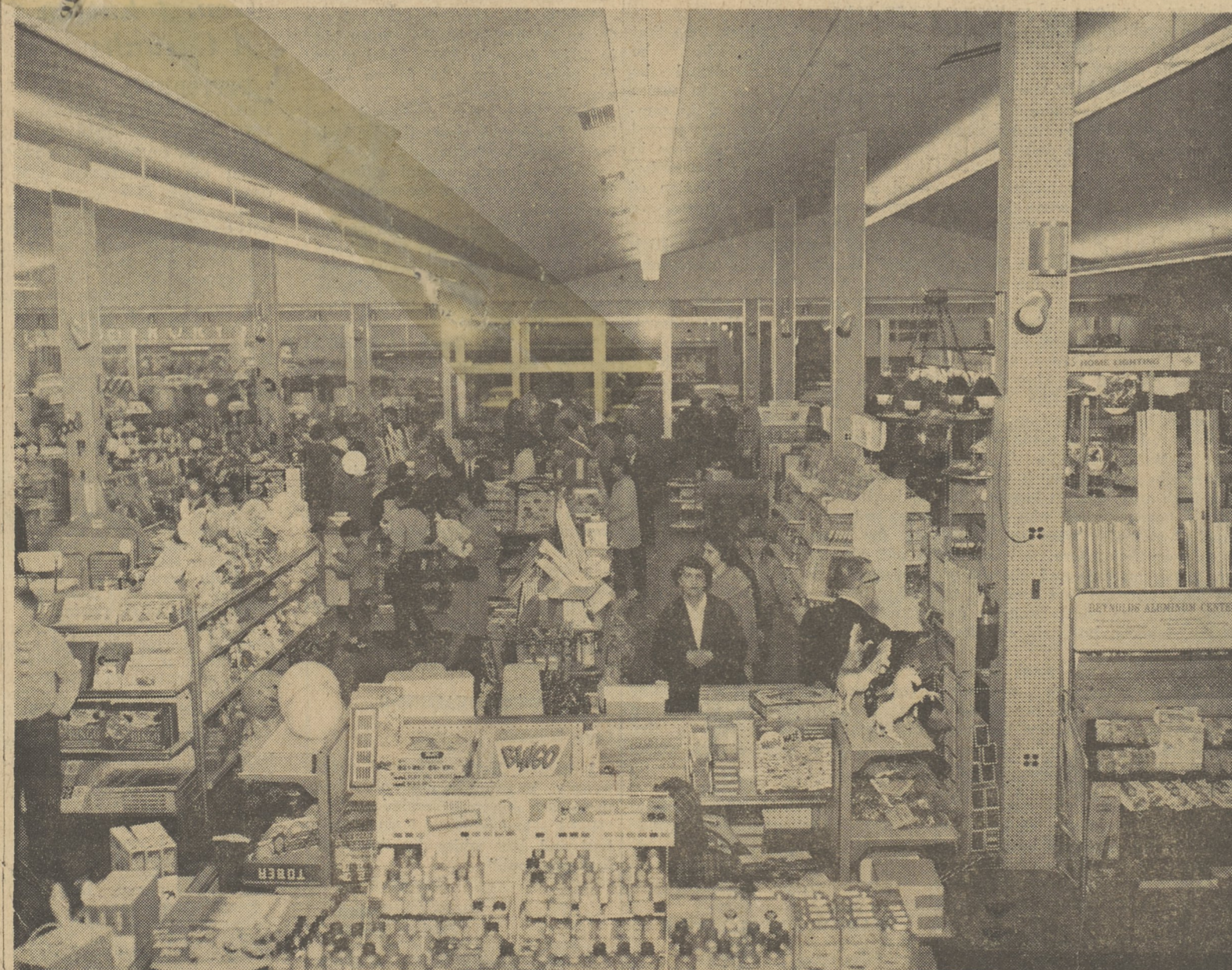
Interior view of the beautiful new Back Mountain Lumber Company Hardware and Gift Store which was visited by more than 7,000 persons during its opening days last Thursday, Friday and Saturday. This view gives only a small idea of the extent of Back Mountain Lumber & Coal Company's extensive operations. The basement of this building, as large as the storm-room itself, is filled with spring and summer merchandise stocked neatly on great rows of modern steel shelving reaching almost from floor to ceiling. During the opening the store was filled with hundreds of floral tributes from well wishers and representatives of national hardware magazines were here to cover the story and obtain photographs for their publications.