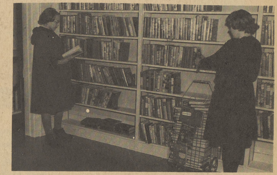
For the first time since the library has been in existence the young people, from seventh grade through high school, have a room of their own at the library. This lovely room has a wealth of modern volumes on its shelves.