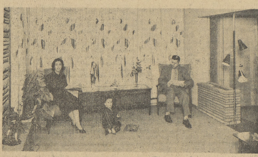
Draft Free Comfort

HERE IS A PICTURE TOUR of the SCHWARTZ GOLD MEDALLION HOME