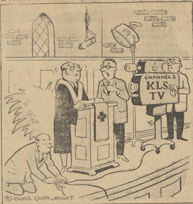
"Give it everything you've got. We're bucking 'Porky Grunt and His Cartoon Pals' on the other channel!"