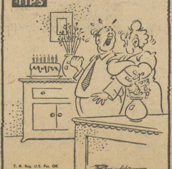
Hey! That bakery in the Want Ads cheated you — there's only 31 candles on your cake!

It's what you learn after you know everything that really counts.