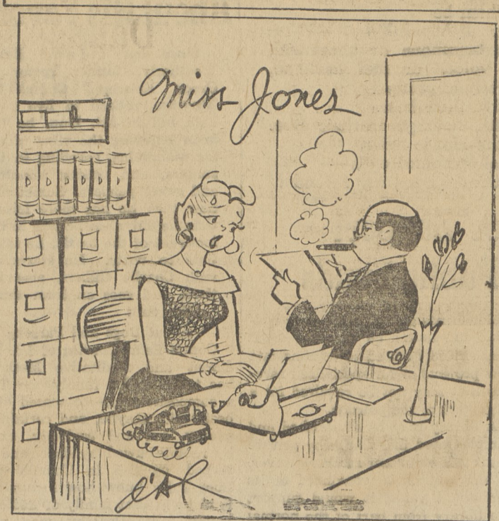
"Make up your mind, boss — do you want this work out by five o'clock or do you want correct spelling?"