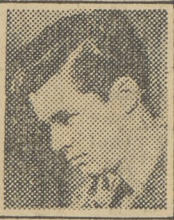
INTO HEMINGWAY OPUS

BOBBY RYDE having just broken his own record at Atlantic City's Steel Pier, goes immediately into Columbia's "The Hill Girl" . . . RICHARD BEYMER just signed to do the Ernest Hemingway story, "Adventures of a Young Man" . . . SEAN FLYNN is starring in a remake of his Dad's classic pic, "Captain Blood" . . . NANCY SINATRA just turned 21 . . . BARBARA LUNA will marry DOUG McCURE in the fall . . . On the 18th of this month, FRANKIE AVARON comes into $250,000 — placed for him in trust . . . ROBERT HORTON will be with "Wagon Train" at least another year . . . The Darin-Dee baby due on New Year's Day . . .