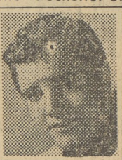
ANKLES '77 SUNSET STRIP"

Miracles . . . EDDIE FISHER modestly billed himself the "Singer of the Decade" in his recent Las Vegas appearance . . . and the CAROL LYNLEY-TUESDAY WELD vendetta is building up to a full scale war . . . See you next month!