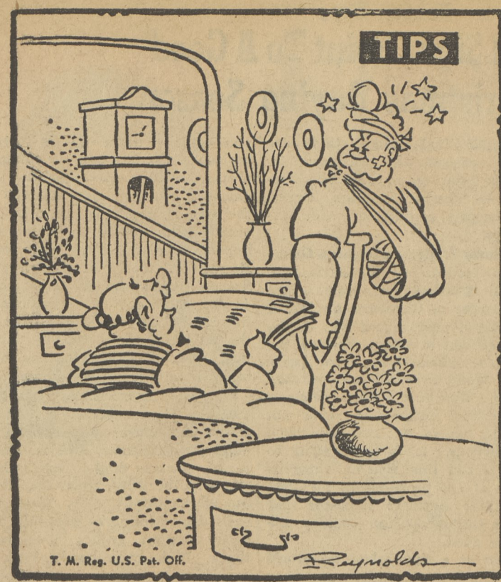
"This body repair shop must've heard about you—they're using the Want Ads again!"