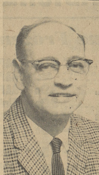
GEORGE E. WEALE COUNCIL