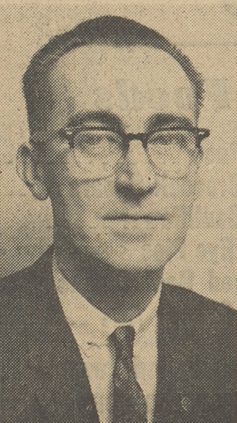
GEORGE D. CAVE COUNCIL