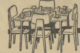
TABLE & 4 CHAIRS