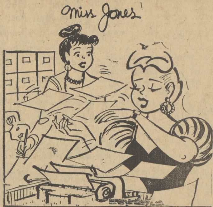
"Quitting time is SO nice... too bad it comes only once a day!"