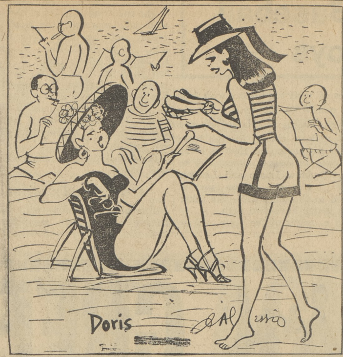
"Spot any stock market journals on the way?"

Under the auspices of the Conference W. S. C. S.