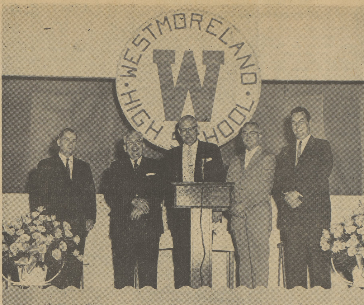
Last Westmoreland High School Class Graduates