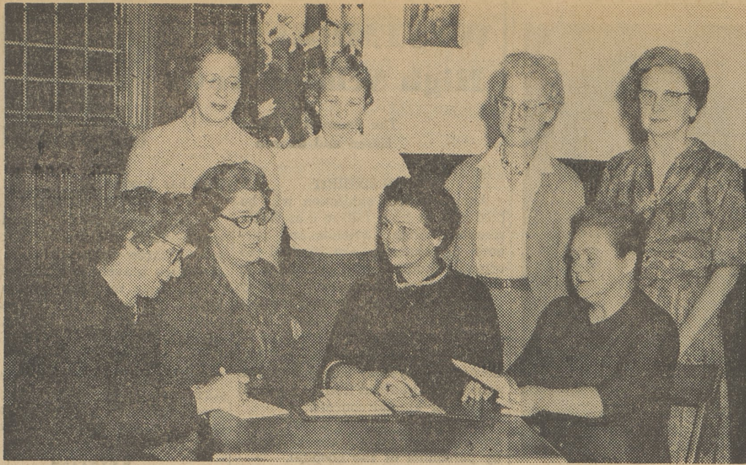
Members of Dallas Methodist Church Durbin Class who are preparing for a concert given by Wilkes College choruses Monday night at the church...