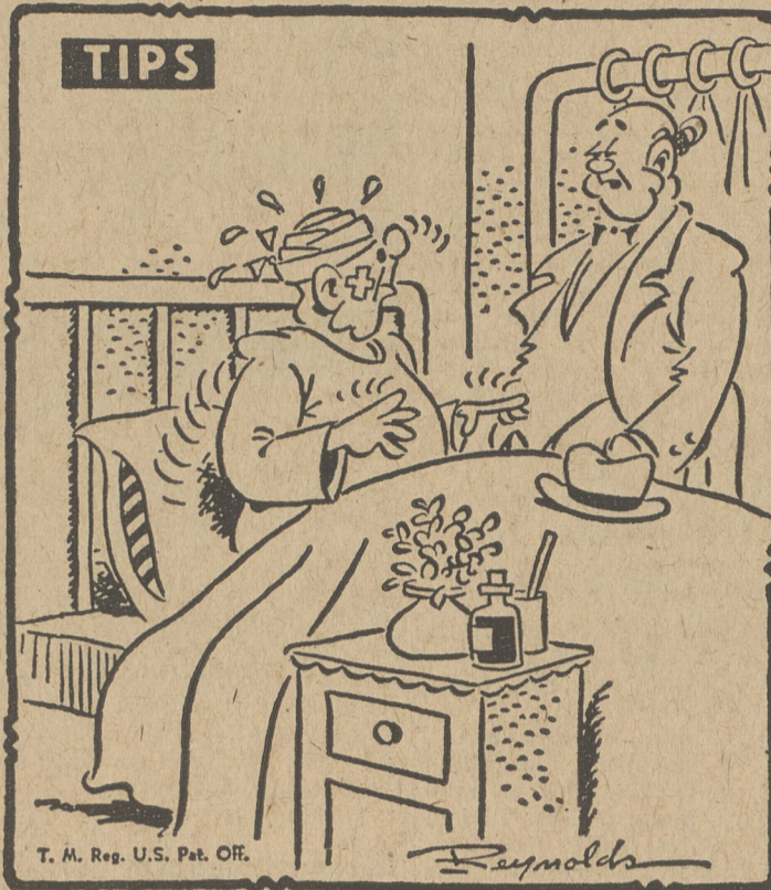
"Stop worrying about the business—since I stopped our Want Ad there's hardly been any!"