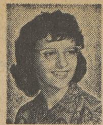
F. T. A.

The Dallas Falcons wrestled a squad lost to Tunkhannock by a score of 26 to 52 and won at Plymouth by a score of 28 to 22. Both games were played away. The students and faculty would like to congratulate the members of both teams for their good showing. Everyone hopes that they may do as well in the following games and meets.