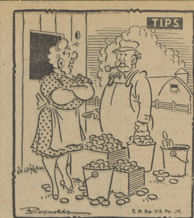
"Lucky we fed that feed we got in the Want Ads - to only three chickens!"

Wheeler's Cafe NOXEN ROAD HARVEYS LAKE EVERY SAT. NIGHT LOBSTER TAIL PLATTER 1/2 Spring Chicken 75c