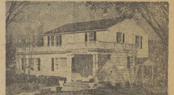
Serving All Faiths

A rehearsal of officers is mandatory Sunday afternoon at 2, at Dallas Methodist Church.