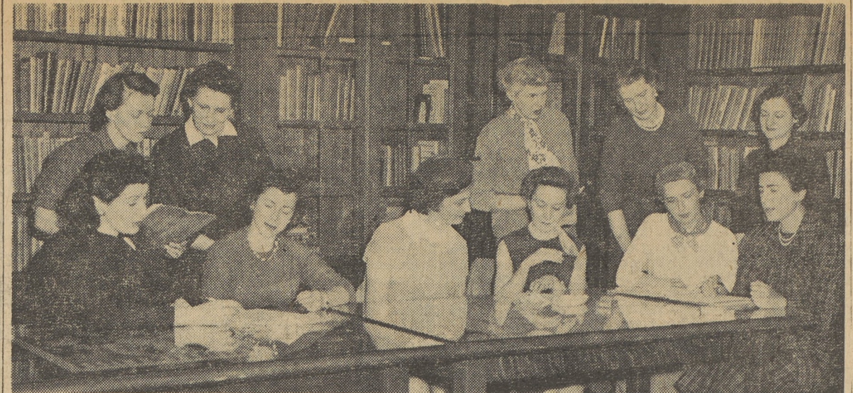
Primary homeroom mothers of Wyoming Seminary Day School above are planning games as a part of the program for the Bazaar to be held April 26 at the school, Wyoming Avenue, Forty Fort. Sponsored by the Parents' Association of the Day School, the Bazaar will begin at 10:30 a.m. and continue until 4 o'clock in the afternoon. The public is most cordially invited.