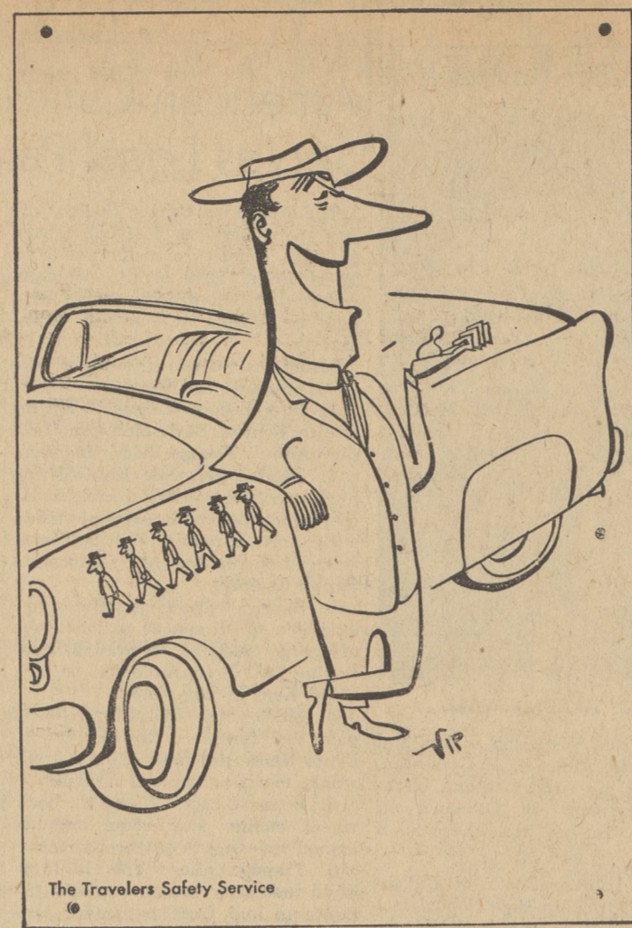
"How many pedestrians have you bagged?"