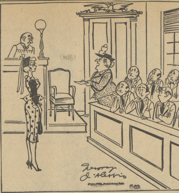
"I—er—we, the jury, find the defendant guilty!"