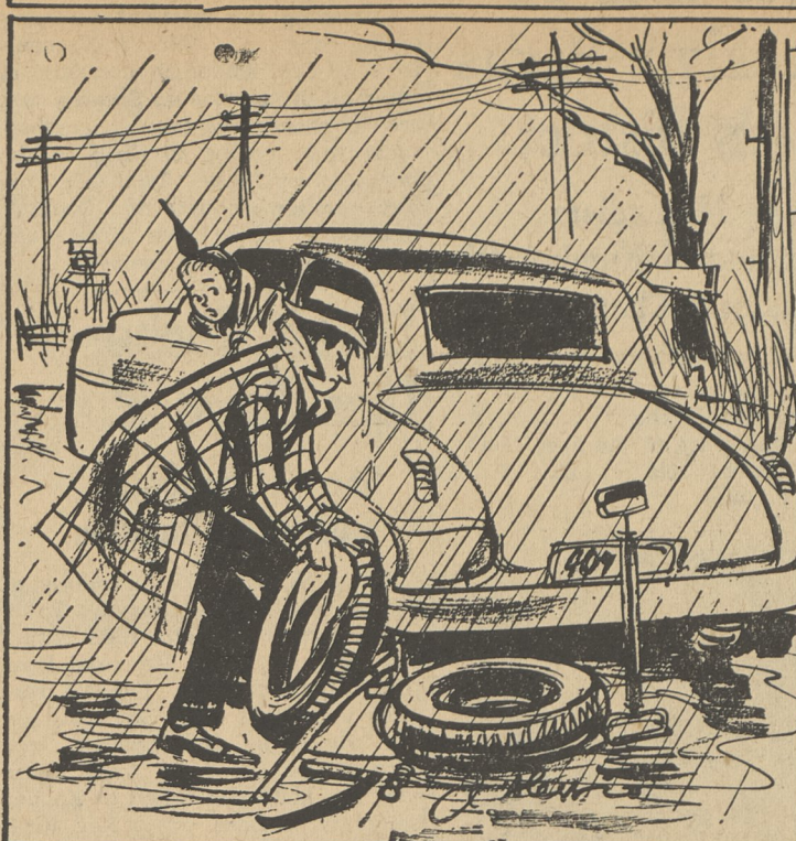
"Herbert, you can say more than 'drat it,' if you want to!"