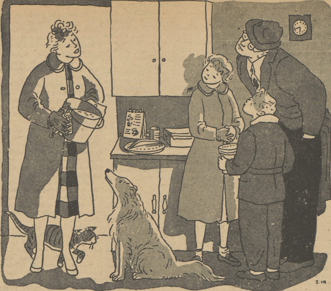
So that fill between here and the church any steeper than this?