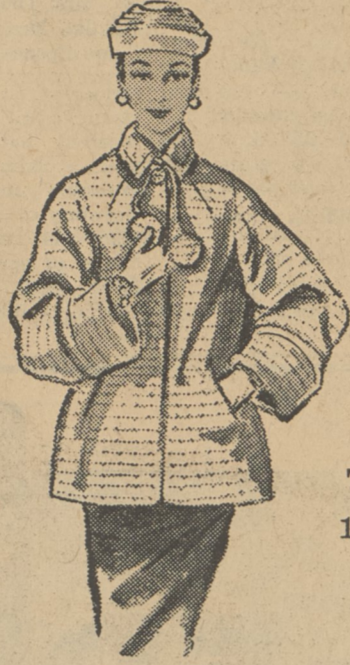
Washable NYLON TOPPERS 10.98 to 16.98

That's right . . . it's time to think of your Easter outfit . . . and that means time to shop at the Back Mountain's favorite department store. Spring fashions are at their loveliest, selections are the freshest. Come in today—select everything you need to dress up from head to toe. Hats, coats, shorties, suits, dresses, gloves, shoes . . . all at prices you can afford.