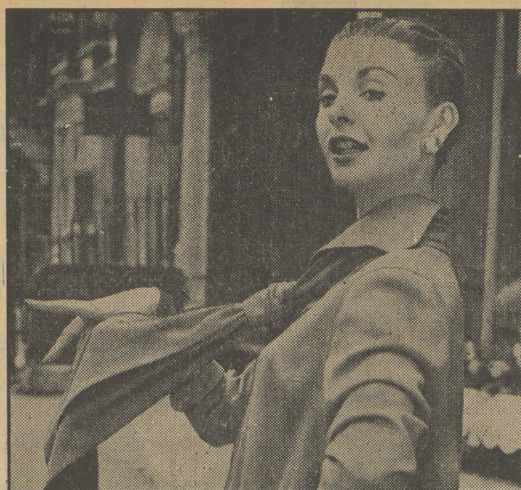
FASHION FUN —Just for fun is this conversation piece, an English import fashioned of green-tinted wool. Huge tie sets off the elastic-base overblouse, which is worn with pleated, unpressed skirt.