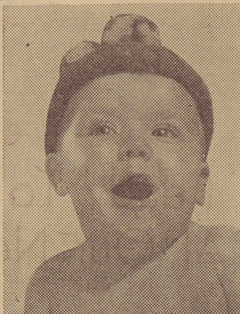
It's easy to keep in shape if you drink PURVIN'S MILK!