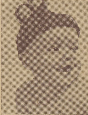
Everybody says I'm the picture of health.