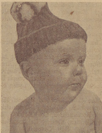
I get lots of compliments!