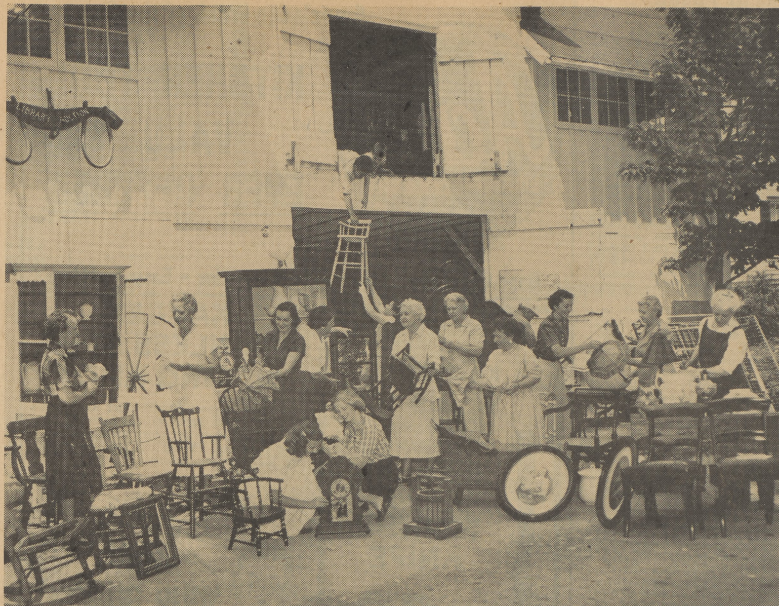
Here are some of your friends who worked last year for the Library Auction and who are again

this season scouring the countryside for antiques to surpass those of all previous auctions. The committee will meet again on Tuesday