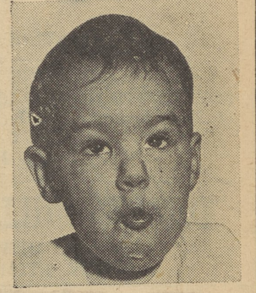
before Mommy gives me my PURVIN'S MILK!