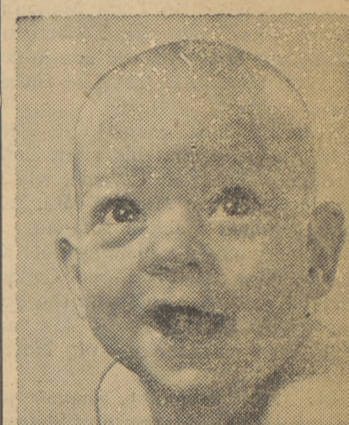
Pour me a glass of PURVIN'S MILK while you're at it!

Purvin DRY COMPANY Extra Fine MILK FOR REGULAR DELIVERY IN THE BACK MT. AREA PHONE ENTERPRISE 1-0813