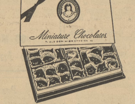
Eighty Pieces of the Finest Assorted Chocolates

Miniature Chocolates by Old Dominion Candies