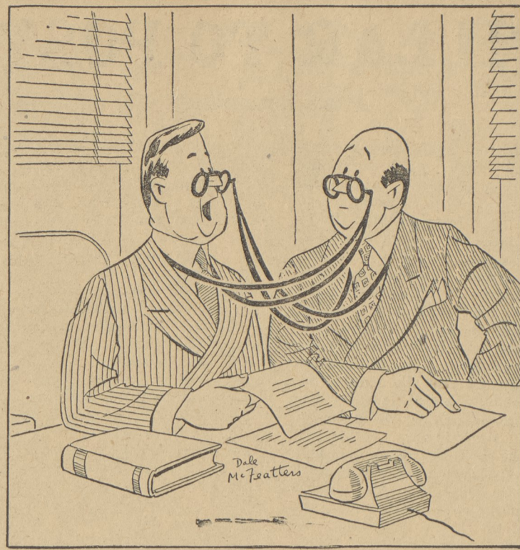
"Funny—things are blurred to me, too!"