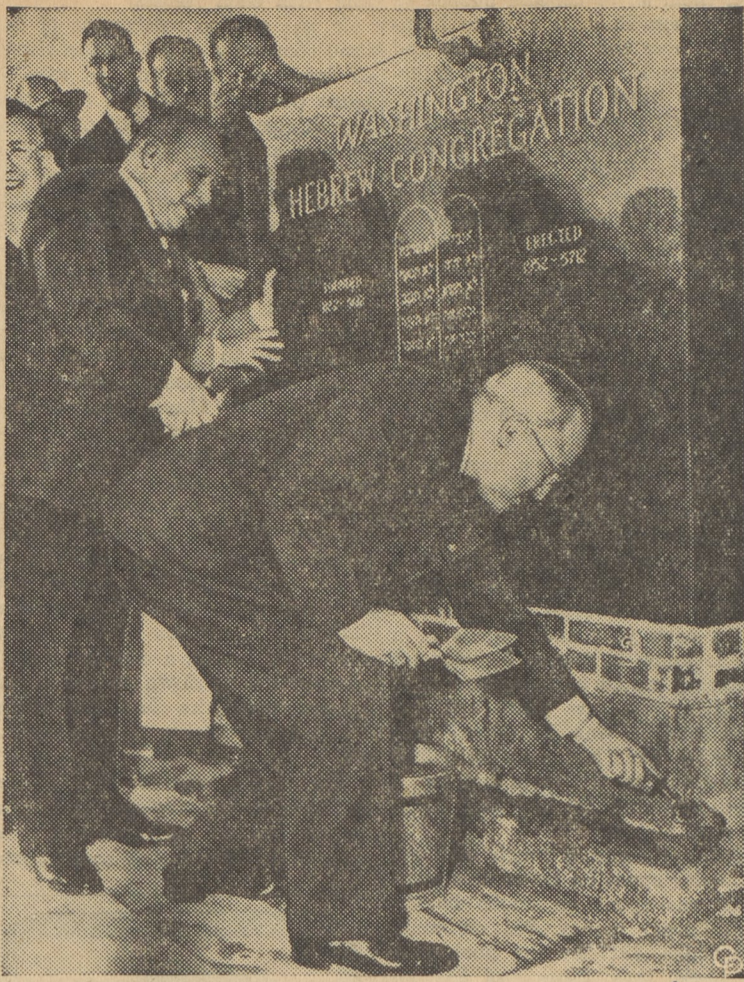
USING A SILVER TROWEL, President Truman lays the cornerstone of a new temple for the 100-year-old Washington Hebrew Congregation. He urged united action against "outbreaks of bigotry."